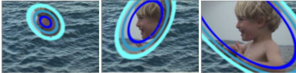
Stretched and Rotated Radial Wipe with Three Borders

The Borders On checkbox is an easy way to enable all the borders contained in this and the Border parameter group. If this checkbox is deselected, no borders are rendered, even if the Borders On checkbox from the previous Borders parameter group is enabled.