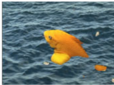
Textured Wipe (Influence on Outgoing)

The Animation menu controls whether the filter auto-animates or is animated manually. Choose from the following options.